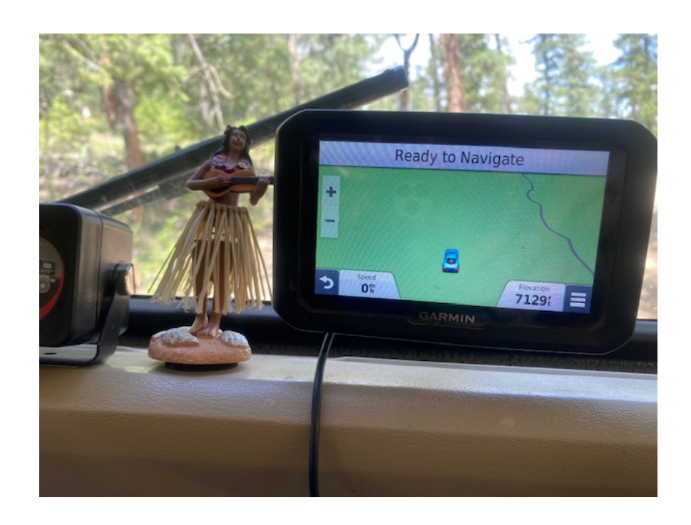
Get back on the TRAIL!!